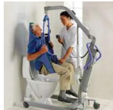
Chassis adjustment enables optimum lift positioning for toileting.