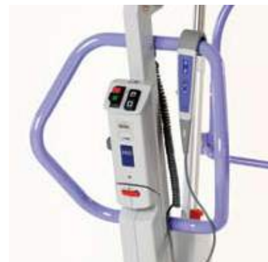
Operate efficiently via the handset or mast control panel. Ergonomically designed push/pull handles for smooth maneuvers.