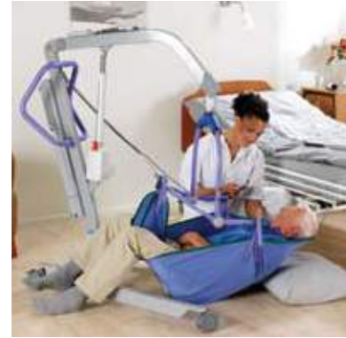
A single caregiver can safely raise a resident from the floor.