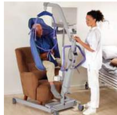
The electronic scale option saves the caregiver's valuable time.