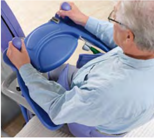
The Arc-Rest offers excellent support and promotes a sense of security.