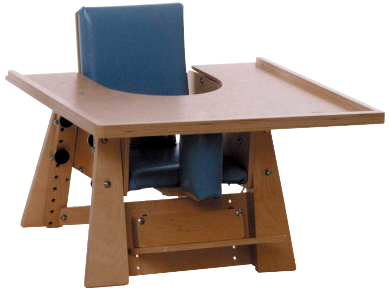
K1 (tray included)