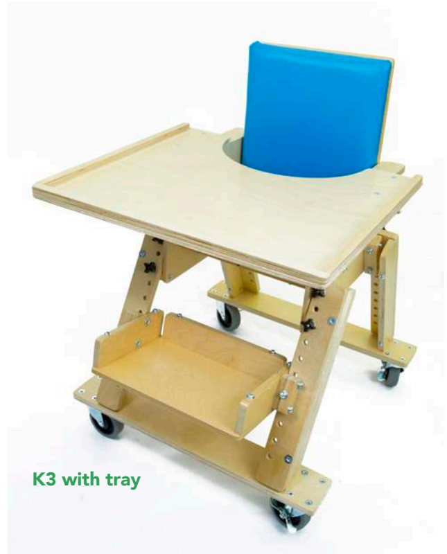
K3 with tray

The abductor pad at the distal third of the thighs maintains the alignment of the hips and knees and inhibits adduction and internal rotation. This, combined with the seat belt across the pelvis, decreases the tendency for the child to either push or slide out of the chair. Additional pelvic stability and femoral alignment can be obtained by adding the optional pelvic femoral stabilizer.