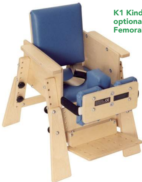
K1 Kinder Chair with optional KFS Pelvic-Femoral Support

Kinder Chairs provide many options to gain the best alignment and postural control possible so that a child can focus on developing and coordinating arm and hand skills. Clinical experts recommend a firm back and appropriate seat depth to align the pelvis and femurs.