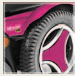
POP STAR PINK