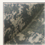
DIGITAL ARMY CAMO