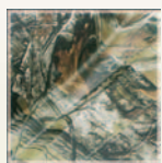
REALTREE AP CAMO