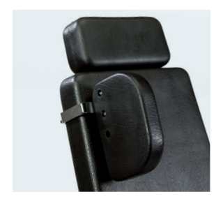
Side supports, interior