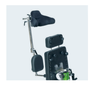
Head support system

88124-xx. For correct positioning and support in the vertical or prone position