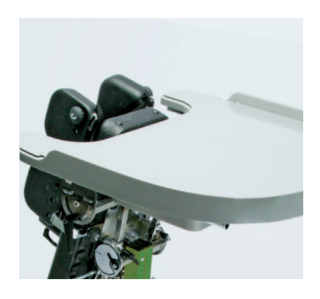
Tray 88108-0 Can be equipped with armrests 861131, Toybar 861135 and Grip handle 861136