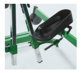
Angling of lower leg