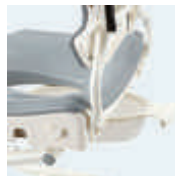
Over a toilet with a potty ring (standard)

The Heron can be used over a toilet, freestanding with a pan, as a bathing chair in the shower and reclined over the bath tub for e.g. shampooing