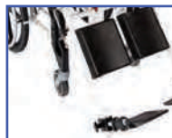
P13572 Right Elevating Leg Rest