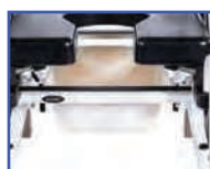
P13836 20"Wx18"D Pan/Hanger