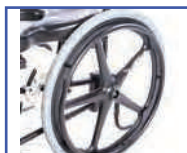
P13865 24" Flat Free Street Tread Wheels (pair)