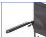
P13616 Right Hand Height-Adjustable Armrest