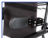
PL13574 Left Hand Swing-Away Adjustable Lateral