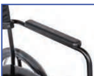
P13715 Left Hand Armrest with Pad