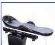
P13717 Left Hand with Arm Trough