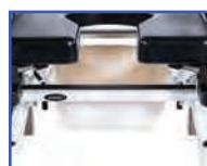
P13838 22"Wx18"D Pan/Hanger