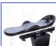
P13718 Right Hand with Arm Trough