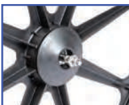
P13707 Quick Release Axles with Tipping Levers (pair)