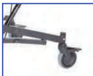
P13854 5" Dual Locking Casters (pair)