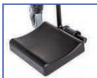
PL11101 Left Padded Foot Plate