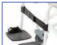
P60879 Calf Strap