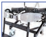
P11114 Bodypoint® Knee Belt