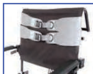
P11102 Bodypoint® Trunk Belt (pair)