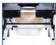
P13834 18"Wx18"D Pan/Hanger