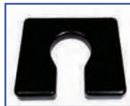
P61038 20"Wx18"D Comfortuff 1.5" waterfall foam Front Open Seat A-5"xB-8" opening