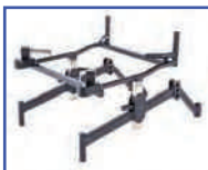
P13721 18"Wx18"D Stainless Steel Frame