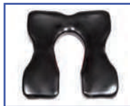
P60974 18"Wx18"D Comfortuff sloped foam Front Open Seat A-4"xB-6.5" opening