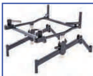
P13722 20"Wx18"D Stainless Steel Frame