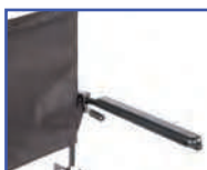
P13615 Left Hand Height-Adjustable Armrest