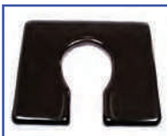
P60905 22"Wx18"D Ensolite® 1" foam Front/Rear Open Seat A-4.5"xB-7.75" opening