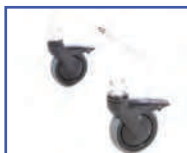
P60800-2 5" Dual Locking Casters (pair)