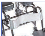
P61081 Bodypoint® Calf Strap