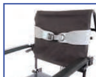
P11093 Bodypoint® Trunk Belt