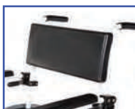
P13713 20"W Solid Back