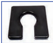
P60993* 18"Wx18"D Comfortuff 1.5" waterfall foam Front/Rear Open Seat A-5"xB-8" opening