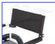
P13690 18"W Sling Back with Stroller Handles