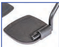
P13891 Left Oversized Aluminum Foot Plate