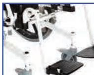
PR13725 Right Leg Rest