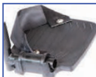
PR11100 Right Foot Plate with Heel Loop