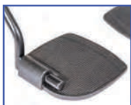
P13892 Right Oversized Aluminum Foot Plate