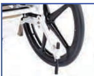
P13708 Bolted Axles with Tipping Levers (pair)