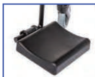
PR11101 Right Padded Foot Plate