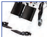
P13571 Left Elevating Leg Rest