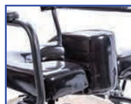
P61006 Abductor/Deflector Large