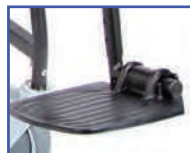
PL11099 Left Foot Plate