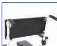
P13693 18"W Solid Back (adjustable depth)