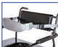
P11112 Bodypoint® XL Trunk Belt