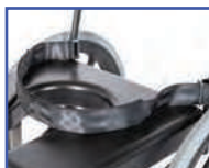
PW60909 Waist Belt (for 18"W frame only, 54" circumference with 12" overlap)