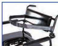
PT60884 Trunk Belt (64", 66" and 68" circumference with 12" overlap)