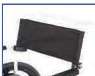
P13712 22"W Sling Back with Stroller Handles