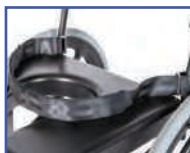
PW60884 Waist Belt (for 20"W and 22"W frame only, 66" and 68" circumference with 12" overlap)