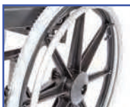
P13857 24" PVC Handrims (replaces standard handrims, pair)