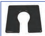
P60903 20"Wx18"D Ensolite® 1" foam Front/Rear Open Seat A-4.5"xB-7.75" opening