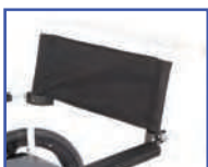
P13710 20"W Sling Back with Stroller Handles