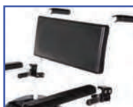
P13691 18"W Solid Back