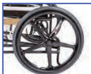
P13862 24" Wheels (pair)