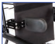
PR13574 Right Hand Swing-Away Adjustable Lateral