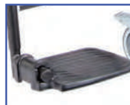
PR11099 Right Foot Plate