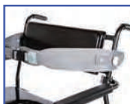
P11113 Bodypoint® Belt w/Quick Release Knobs