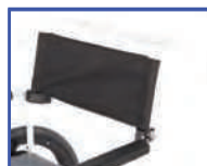
P13692 18"W Sling Back with Stroller Handles (adjustable depth)