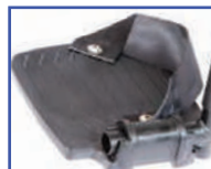
PL11100 Left Foot Plate with Heel Loop