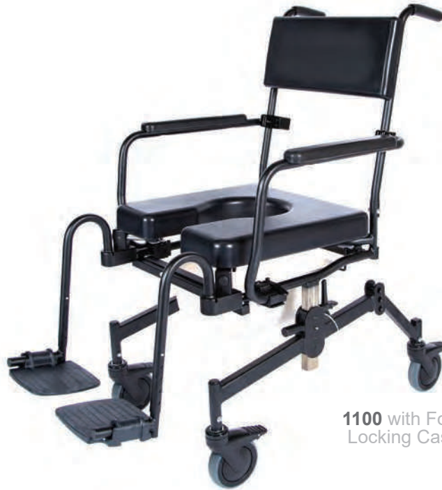
1100 with Four 5" Locking Casters