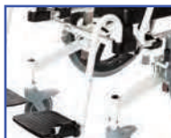
PL13725 Left Leg Rest