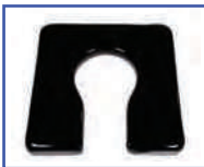
P60850* 18"Wx18"D Ensolite® 1" waterfall foam Front/Rear Open Seat A5"xB-8" opening