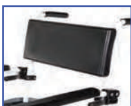
P13714 22"W Solid Back