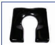
P61058 18"Wx18"D Ensolite® 2" waterfall foam Front Open Contoured Seat A-5.5"xB-8.25" opening