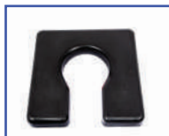
P60993* 18"Wx18"D Comfortuff 1.5" waterfall foam Front/Rear Open Seat A-5"xB-8" opening