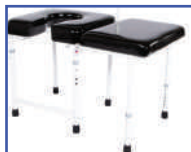
P13294 B-O Transfer Bench