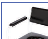
PR13291 Right Hand Armrest with Pad