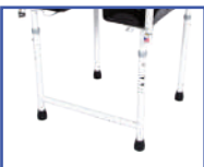
P13642 Legs w/Crutch Tips (height seat range from floor to bottom frame-19.5"-22.5")