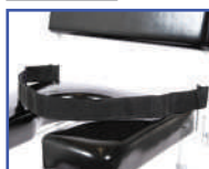
PW60908 Waist Belt (48" circumference with 12" velcro overlap)