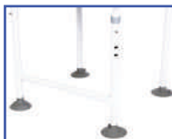
P13643 Legs w/Suction Tips (height seat range from floor to bottom frame-19.5"-22.5")