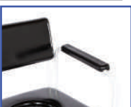
PL13291 Left Hand Armrest with Pad