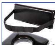
PT60908 Trunk Belt (48" circumference with 12" velcro overlap)