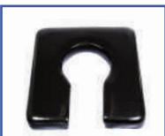
P60913* 18"Wx18"D Ensolite® 2" waterfall foam Front/Rear Open Seat A-5.25"xB-8" opening