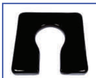
P60850* 18"Wx18"D Ensolite® 1" waterfall foam Front/Rear Open Seat A-5"xB-8" opening