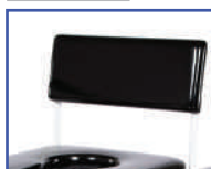
P13295 Back Tubes w/Solid Back Pad (13.5"H)