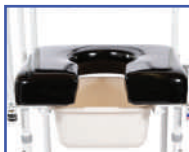
P13644 18"Wx18"D Pan/Hanger