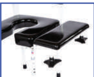
P13352 Short Transfer Bench