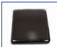
P61086* 18"Wx18"D Ensolite® 2" foam Solid Seat