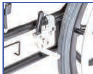
P60532 Wheel Locks (pair)