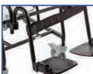
PR13581 Right Gooseneck Leg Rest