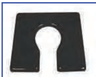
P60903 20"Wx18"D Ensolite® 1" foam Front/Rear Open Seat A-4.5"xB-7.75" opening