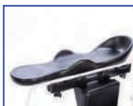
P13614 Right Hand Armrest with Arm Trough