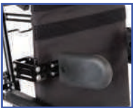
PR13574 Right Hand Swing-Away Adjustable Lateral