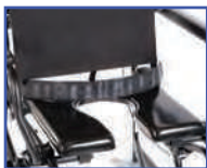
PW60884 Waist Belt (62", 64", 66", or 68" circumference with 12" overlap)