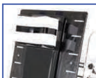
P11105 Head Support Small Foam (only available for P11106)