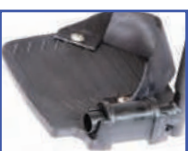
PL11100 Left Foot Plate with Heel Loop