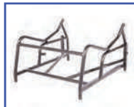
P13638 22"Wx18"D Stainless Steel Frame