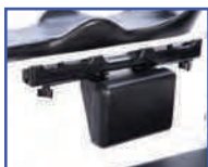
PR13618 Right Hand Arm-Mounted Hip Guide