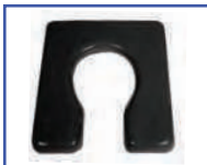
P61124 16"Wx18"D Ensolite® 1" foam Front/Rear Open Seat A-4.75"xB-7.75" opening