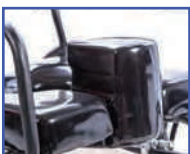
P61006 Abductor/Deflector Small