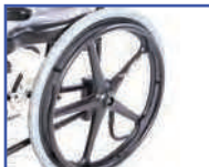
P13865 24" Flat Free Street Tread Wheels (pair)