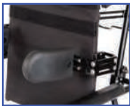
PL13574 Left Hand Swing-Away Adjustable Lateral