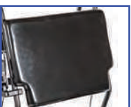
P11107 18"W Solid Back