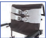
P11102 Bodypoint® Trunk Belt (pair)