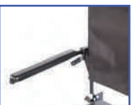
P13616 Right Hand Height-Adjustable Armrest