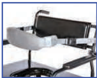
P11112 Bodypoint® XL Trunk Belt