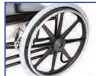
P13864 24" Pneumatic Street Tread Wheels (pair)