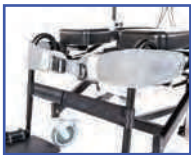
P11114 Bodypoint® Knee Belt