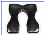
P60974 18"Wx18"D Comfortuff sloped foam Front Open Seat A-4"xB-6.5" opening