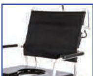
P61140 22"W Adjustable Sling Back