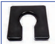
P60993 18"Wx18"D Comfortuff 1.5" waterfall foam Front/Rear Open Seat A-5"xB-8" opening