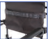
PT61180 Trunk Belt (for 20"W and 22"W frames only, 58" circumference with 12" overlap)