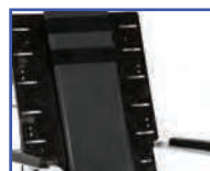
P11106 16"W Solid Back Full Length w/ Center Pad