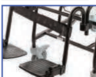
PL13581 Left Gooseneck Leg Rest