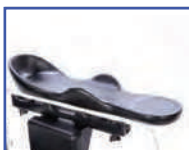
P13613 Left Hand Armrest with Arm Trough