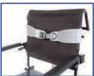
P11093 Bodypoint® Trunk Belt