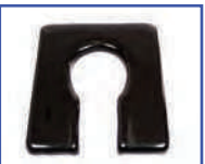
P61121 18"Wx20"D Ensolite® 1" foam Front Open Seat A-4.5"xB-7.5" opening