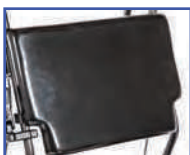
P11109 22"W Solid Back