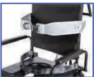
P11116 Bodypoint® Trunk Belt & Waist Belt