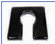
P60802 18"Wx18"D Ensolite® 1.25" foam Front Open Ring Seat A-4.5"xB-7.75" opening