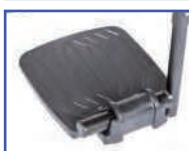
PL11099 Left Foot Plate