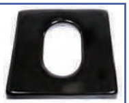
P60887 22"Wx20"D Ensolite® 1.5" foam Race Track Oval Seat A-7.75"xB-12.75" opening