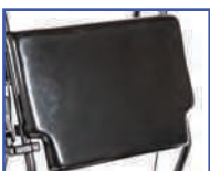
P11108 20"W Solid Back