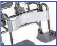
P61081 Bodypoint® Calf Strap