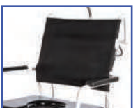
P60878 20"W Adjustable Sling Back