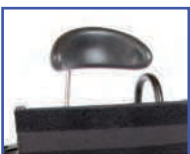
P13621 Head Support Large