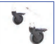
P60800-2 5" Dual Locking Casters (pair)