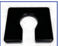
P61038 20"Wx18"D Comfortuff 1.5" waterfall foam Front Open Seat A-5"xB-8" opening