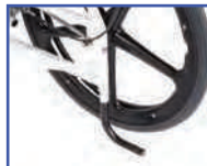
P13688 Bolted Axles with Tipping Levers (pair)