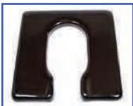
P61123 20"Wx20"D Ensolite® 1" waterfall foam Front/Rear Open Seat A-4.5"xB-7.75" opening