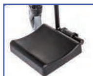
PL11101 Left Padded Foot Plate