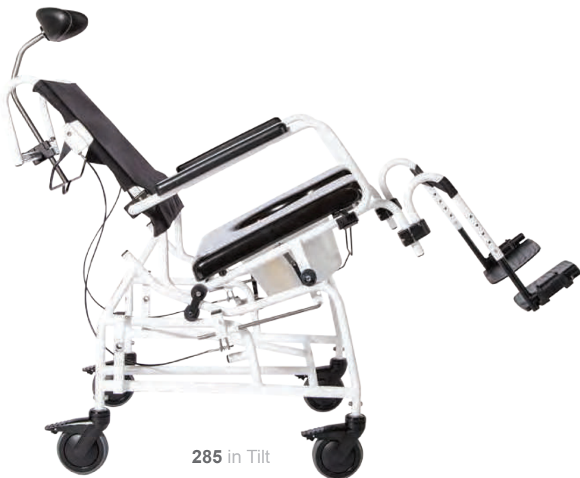
285 in Tilt