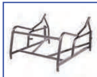
P13637 20"Wx18"D Stainless Steel Frame