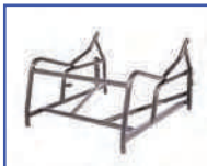
P13635 16"Wx18"D Stainless Steel Frame