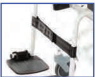
P60879 Calf Strap