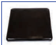
PP61122 20"Wx18"D Ensolite® 1" foam Solid Seat