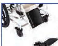
P13583 Right Elevating Leg Rest