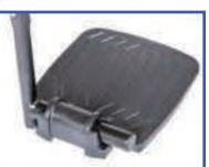
PR11099 Right Foot Plate