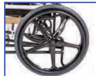
P13862 24" Wheels (pair)