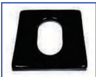
P60886 20"Wx20"D Ensolite® 1.5" foam Race Track Oval Seat A-7.75"xB-12.75" opening