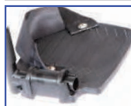
PR11100 Right Foot Plate with Heel Loop