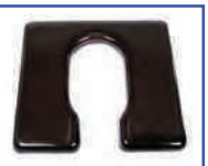
P61126 22"Wx20"D Ensolite® 1" waterfall foam Front/Rear Open Seat A-4.5"xB-7.75" opening