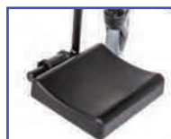
PR11101 Right Padded Foot Plate