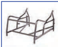
P13636 18"Wx18"D Stainless Steel Frame