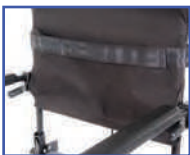
PT60910 Trunk Belt (for 16"W and 18"W frames only, 48" circumference with 12" overlap)