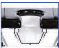
P13831 Pan/Hanger for Ring and Contoured Seats