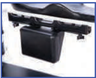
PL13618 Left Hand Arm-Mounted Hip Guide