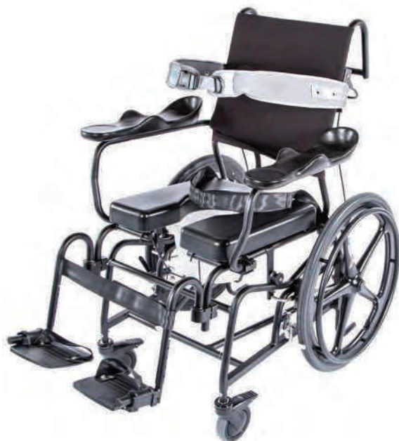
PKG207 Package #5 - 18"W x 18"D