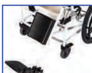
P13582 Left Elevating Leg Rest