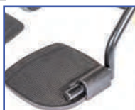
P13891 Left Oversized Aluminum Foot Plate