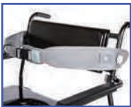
P11113 Bodypoint® Belt w/Quick Release Knobs