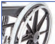
P13857 24" PVC Handrims (replaces standard handrims, pair)