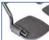
P13892 Right Oversized Aluminum Foot Plate