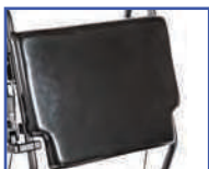
P11110 16"W Solid Back