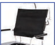
P60877 18"W Adjustable Sling Back