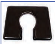
P60905 22"Wx18"D Ensolite® 1" foam Front/Rear Open Seat A-4.5"xB-7.75" opening