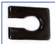
PP61121 20"Wx18"D Ensolite® 1" foam Side Open Seat A-4.5"xB-7.5" opening