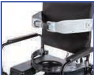
P11116 Bodypoint® Trunk Belt & Waist Belt