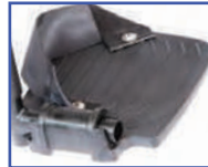
PR11100 Right Foot Plate with Heel Loop