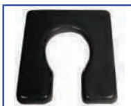
P61124 16"Wx18"D Ensolite® 1" foam Front Open Seat A-4.75"xB-7.75" opening