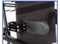
PR13574 Right Hand Swing-Away Adjustable Lateral