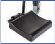
PR11101 Right Padded Foot Plate