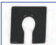
P60903 18"Wx20"D Ensolite® 1" foam Front/Rear Open Seat A-4.5"xB-7.75" opening