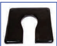
P61126 22"Wx22"D Ensolite® 1" waterfall foam Front/Rear Open Seat A-5"xB-8" opening