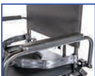
P13735 20"D Left Hand Armrest with Pad