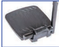
PL11099 Left Foot Plate