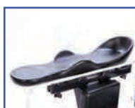
P13738 20"D Right Hand Armrest with Arm Trough