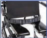
PW60884 Waist Belt (62\", 64\", 66\", or 68\" circumference with 12\" overlap)