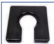
P60993* 18"Wx18"D Comfortuff 1.5" waterfall foam Front/Rear Open Seat A-5"xB-8" opening