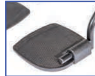
P13891 Left Oversized Aluminum Foot Plate