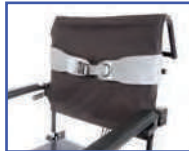
P11093 Bodypoint® Trunk Belt