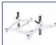
P13768 22"Wx20"D Stainless Steel Frame