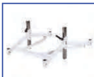
P13765 20"Wx18"D Stainless Steel Frame