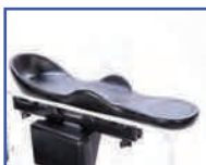
P13737 20"D Left Hand Armrest with Arm Trough