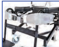
P11114 Bodypoint® Knee Belt