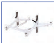
P13764 18"Wx20"D Stainless Steel Frame