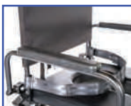
P13730 18"D Right Hand Armrest with Pad