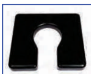
P61038 20"Wx18"D Comfortuff 1.5" waterfall foam Front Open Seat A-5"xB-8" opening