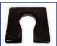
P61123* 20"Wx20"D Ensolite® 1" waterfall foam Front/Rear Open Seat A-5"xB-8" opening