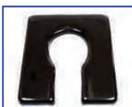
P61121 18"Wx20"D Ensolite® 1" foam Front/Rear Open Seat A-4.5"xB-7.5" opening