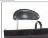
P13758 Head Support XL