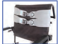
P11102 Bodypoint® Trunk Belt (pair)