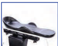
P13731 18"D Left Hand Armrest with Arm Trough