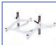
P13767 22"Wx18"D Stainless Steel Frame