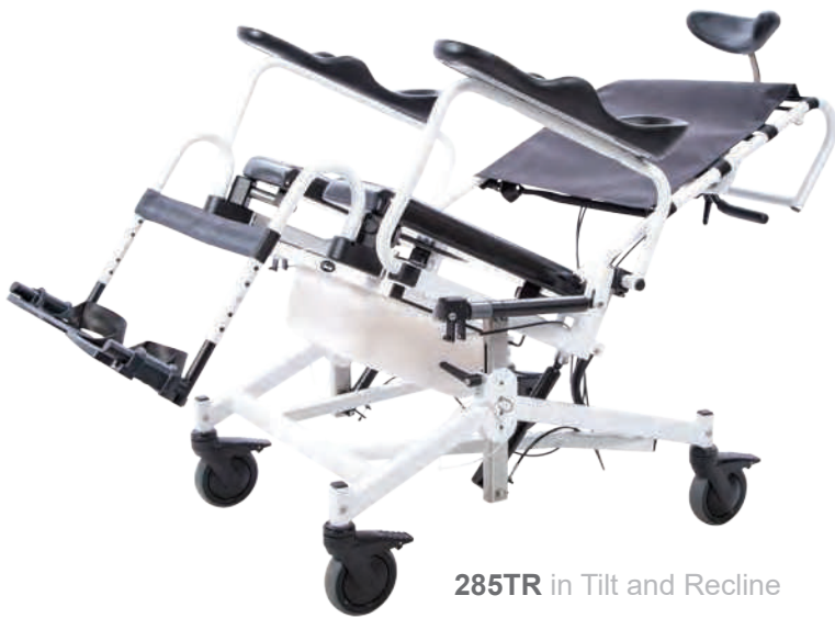
285TR in Tilt and Recline