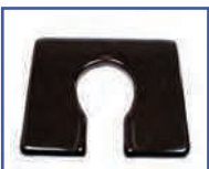
P60905 22"Wx18"D Ensolite® 1" foam Front/Rear Open Seat A-4.5"xB-7.75" opening