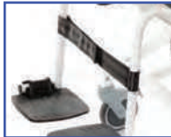
P60879 Calf Strap