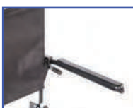
P13615 Left Hand Height-Adjustable Arms