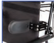
PL13574 Left Hand Swing-Away Adjustable Lateral