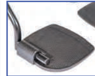
P13892 Right Oversized Aluminum Foot Plate