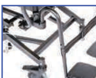
PR13725 Right Leg Rest