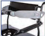
P11113 Bodypoint® Belt w/Quick Release Knobs