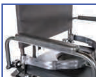
P13736 20"D Right Hand Armrest with Pad