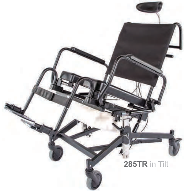
285TR in Tilt