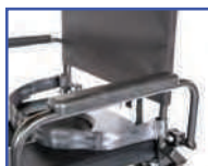
P13729 18"D Left Hand Armrest with Pad