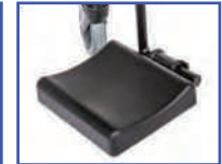
PL11101 Left Padded Foot Plate