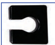
PP61038 18"Wx20"D Comfortuff 1.5" waterfall foam Side Open Seat A-5"xB-8" opening