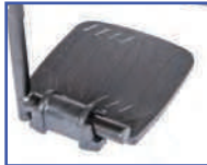
PR11099 Right Foot Plate