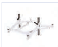
P13762 16"Wx18"D Stainless Steel Frame