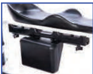
PL13618 Left Hand Arm-Mounted Hip Guide