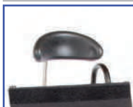
P13621 Head Support Large