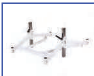
P13763 18"Wx18"D Stainless Steel Frame