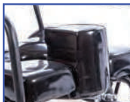
P61006 Abductor/Deflector Small