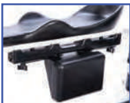
PR13618 Right Hand Arm-Mounted Hip Guide