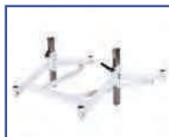
P13766 20"Wx20"D Stainless Steel Frame