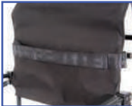
PT60884 Trunk Belt (62\", 64\", 66\", or 68\" circumference with 12\" overlap)