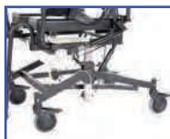
P60800-4 5" Dual Locking Casters (2 pair)