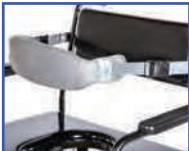
P11112 Bodypoint® XL Trunk Belt