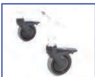
P13770 5" Casters (pair) and 5" Dual Locking Casters (pair)