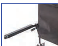
P13616 Right Hand Height-Adjustable Arms