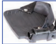
PL11100 Left Foot Plate with Heel Loop