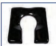
P61058 18"Wx18"D Ensolite® 2" waterfall foam Front Open Contoured Seat A-5.5"xB-8.25" opening