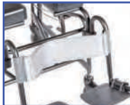
P61081 Bodypoint® Calf Strap