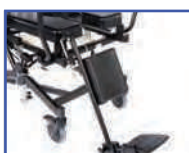
P13572 Right Elevating Leg Rest