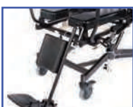
P13571 Left Elevating Leg Rest