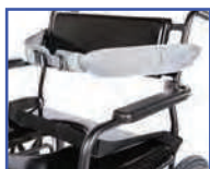
P11116 Bodypoint® Trunk Belt & Waist Belt