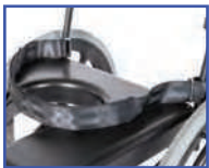
PW60884 Waist Belt (for 20"W and 22"W frames only, 66" and 68" circumference with 12" overlap)