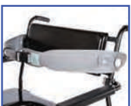
P11113 Bodypoint® Belt w/Quick Release Knobs