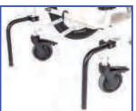
P13670 Front Anti-Tippers