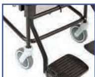
P13666 Right Leg Rest