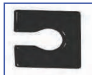
PP60903 18"Wx20"D Ensolite® 1" foam Side Open Seat A-4.5"xB-7.75" opening