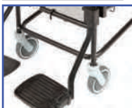
P13665 Left Leg Rest