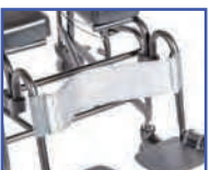
P61081 Bodypoint® Calf Strap (only available with 18" back)