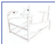
P13675 18"Wx18"D Stainless Steel Frame