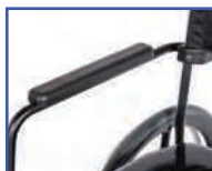
P13664 20"D Right Hand Armrest with Pad