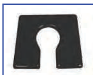
P60903 18"Wx18"D Ensolite® 1" foam Front/Rear Open Seat A-4.5"xB-7.75" opening