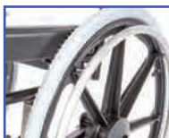
P13857 24" PVC Handrims (replaces standard handrims, pair)