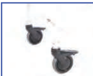
P60800-2 5" Dual Locking Casters (pair)