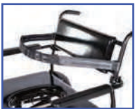
PT60884 Trunk Belt (64", 66" and 68" circumference with 12" overlap)