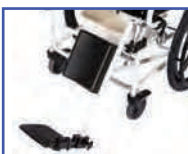
P13582 Left Elevating Leg Rest