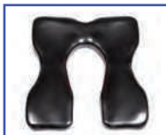
P60974 18"Wx18"D Comfortuff sloped foam Front Open Seat A-4"xB-6.5" opening