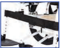
P60879 Calf Strap