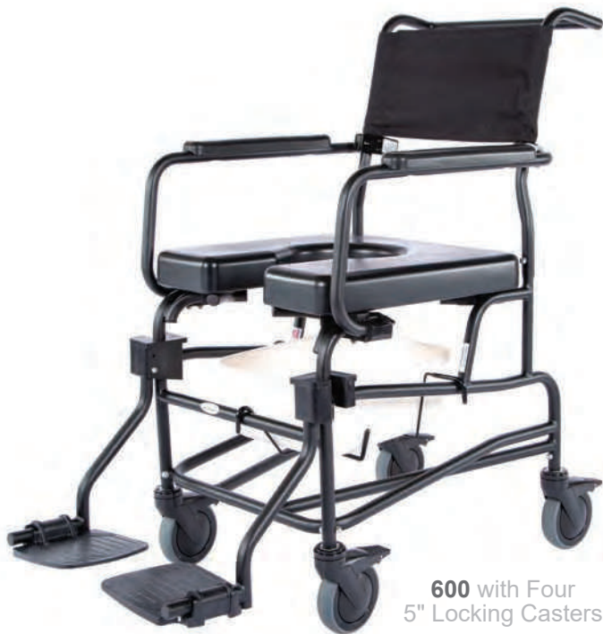
600 with Four 5" Locking Casters