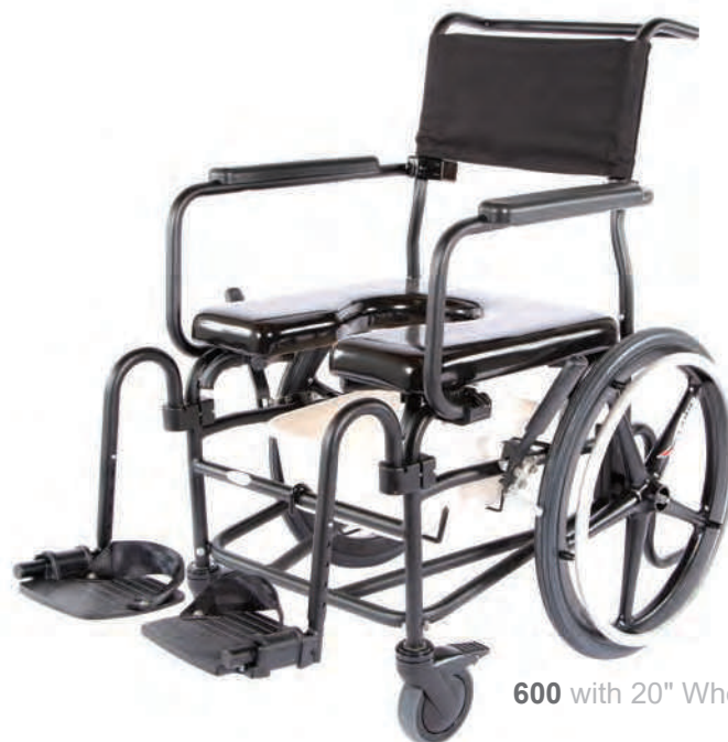
600 with 20" Wheels