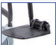
PL11099 Left Foot Plate