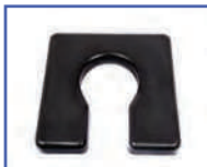
P60993* 18"Wx18"D Comfortuff 1.5" waterfall foam Front/Rear Open Seat A-5"xB-8" opening