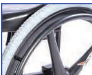
P13855 20" PVC Handrims (replaces standard handrims, pair)