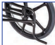
P13649 Bolted Axles with Wheel Mounts and Tipping Levers (pair)