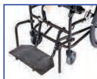
P13667 18"W 1-pc. Foot Plate/Leg Rest