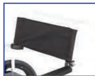
P13661 22"W Sling Back with Stroller Handles