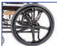
P13862 24" Wheels (pair)