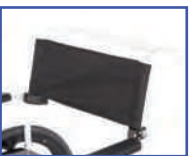
P13658 20"W Sling Back with Stroller Handles