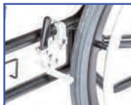
P60532 Wheel Locks (pair)