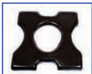
P60675 18"Wx18"D Ensolite® 1" foam Cloverleaf Seat A-7.5"xB-9" oval opening