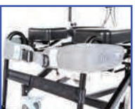
P11114 Bodypoint® Knee Belt