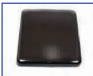
P61086 18"Wx18"D Ensolite® 2" foam Solid Seat