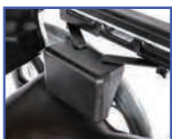
PL13618 Left Hand Arm-Mounted Hip Guide