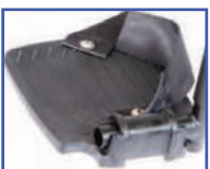
PL11100 Left Foot Plate with Heel Loop