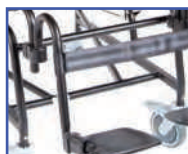
PR13581 Right Gooseneck Leg Rest