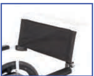
P13651 18"W Sling Back with Stroller Handles