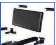
P13652 18"W Solid Back