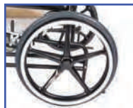
P13860 20" Wheels (pair)