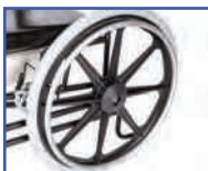
P13864 24" Pneumatic Street Tread Wheels (pair)