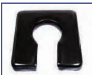
P60913* 18"Wx18"D Ensolite® 2" waterfall foam Front/Rear Open Seat A-5.25"xB-8" opening