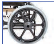
P13863 20" Pneumatic Street Tread Wheels (pair)