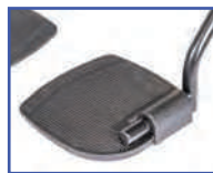
P13891 Left Oversized Aluminum Foot Plate