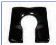
P61058 18"Wx18"D Ensolite® 2" waterfall foam Front Open Contoured Seat A-5.5"xB-8.25" opening