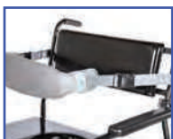
P11112 Bodypoint® XL Trunk Belt