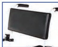
P13659 20"W Solid Back