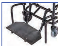
P13669 22"W 1-pc. Foot Plate/Leg Rest