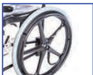
P13865 24" Flat Free Street Tread Wheels (pair)