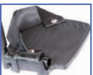
PR11100 Right Foot Plate with Heel Loop