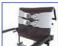
P11102 Bodypoint® Trunk Belt (pair)