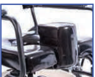
P61006 Abductor/Deflector Large