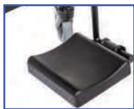
PL11101 Left Padded Foot Plate