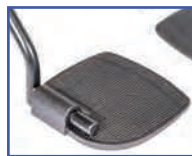
P13892 Right Oversized Aluminum Foot Plate