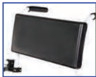
P13662 22"W Solid Back