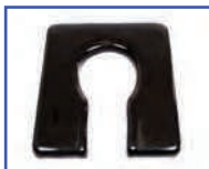
P61121 18"Wx20"D Ensolite® 1" foam Front/Rear Open Seat A-4.5"xB-7.5" opening