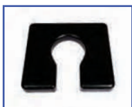
P61038 20"Wx18"D Comfortuff 1.5" waterfall foam Front Open Seat A-5"xB-8" opening