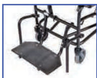
P13668 20"W 1-pc. Foot Plate/Leg Rest