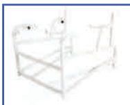
P13678 22"Wx18"D Stainless Steel Frame