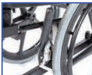
P13135 Wheel Locks with Extended Handle (pair)