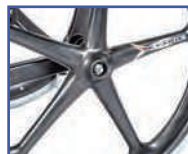
P13650 Quick Release Axles with Wheel Mounts and Tipping Levers (pair)