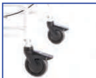
P60800-2 5" Dual Locking Casters (pair)