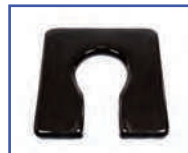
P60701* 18"Wx18"D Ensolite® 1" foam Front/Rear Open Seat A-4.55"xB-7.75" opening