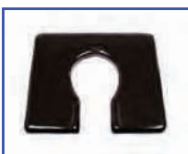
P60905 22"Wx18"D Ensolite® 1" foam Front/Rear Open Seat A-4.5"xB-7.75" opening