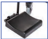
PR11101 Right Padded Foot Plate