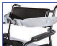
P11093 Bodypoint® Trunk Belt