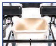
P13840 18"Wx18"D Pan/Hanger