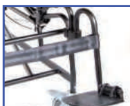
PL13581 Left Gooseneck Leg Rest