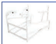
P13677 20"Wx18"D Stainless Steel Frame