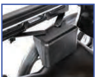
PR13618 Right Hand Arm-Mounted Hip Guide