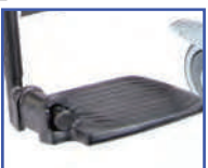
PR11099 Right Foot Plate