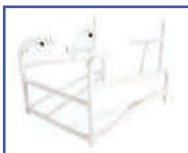
P13676 18"Wx20"D Stainless Steel Frame