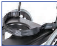
PW60909 Waist Belt (for 18"W frame only, 54" circumference with 12" overlap)