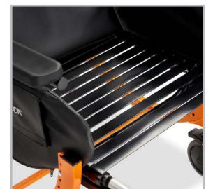
Comfort Tension Seating ® increases support and sitting tolerance.