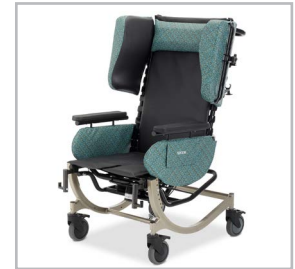
New frame design, including adjustable wings.