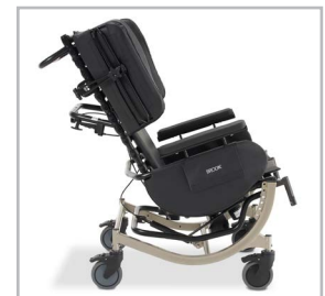
Front pivot seat tilt maintains a proper position for self-propulsion.