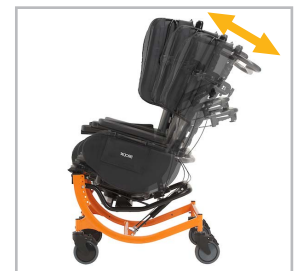
Pedal Rocker calms and creates contentment.