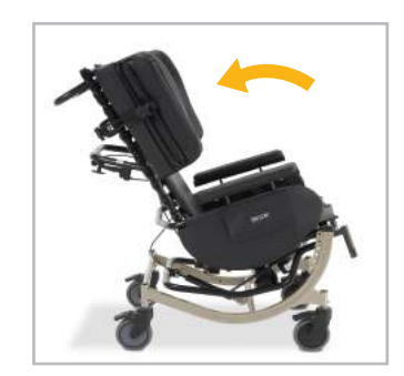
Front pivot seat tilt maintains a proper position for self-propulsion