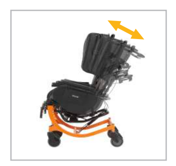
Optional dynamic rocking feature calms and creates contentment