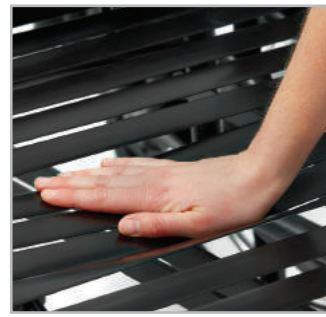
Comfort Tension Seating* increases support as well as sitting tolerance