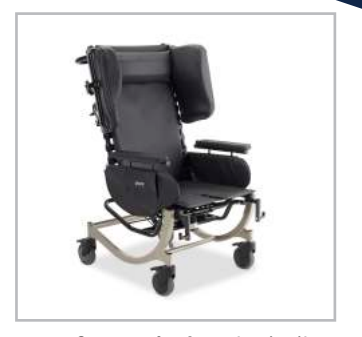
New frame design, including adjustable wings and tall back option