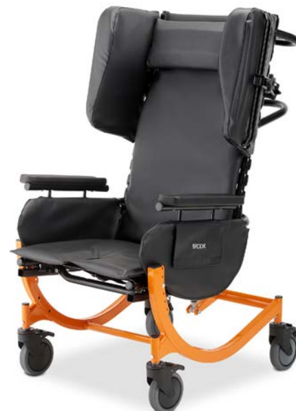
Shown with long back and shoulder bolsters.