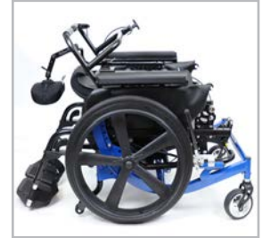
Back canes fold down for easy vehicle loading.