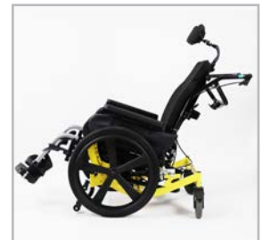
Front pivot seat tilt maintains a proper position for self-propulsion.