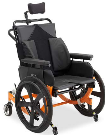
Shown with short back, headrest, lateral supports, and front mag wheels.