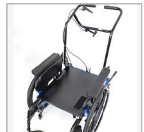
Open seating system allows for almost any padding configuration.