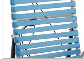
Individualized fit for superior comfort