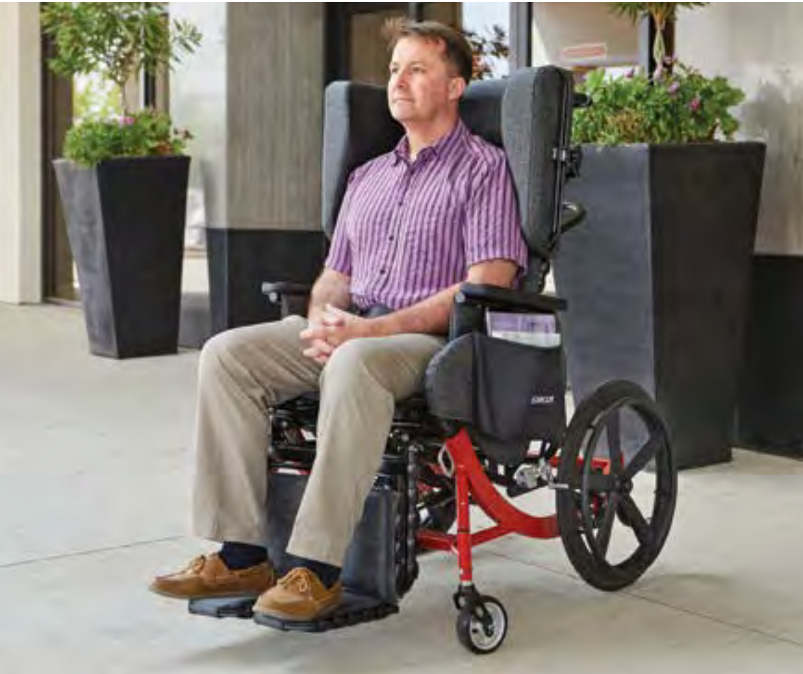
Accessory bag provides convenience and enhanced quality of life allowing patients to bring personal belongings with them on the go.