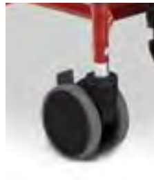
5" Front Twin Wheel Caster (Upgraded)