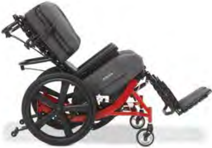
Up to 40° infinitely adjustable seat tilt. (use up to 13° tilt during transport)

As a patient's primary chair, transports can be done with ease helping to maintain patient contentment.