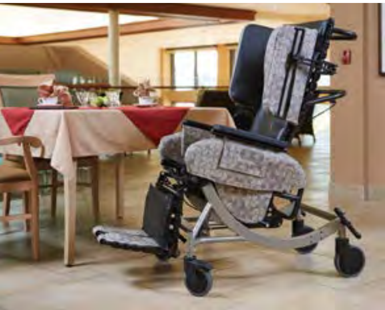
Ideal for both transport and facility use.

The number and cost of transfers are reduced as the Synthesis Transport Chair can also serve as the patient's primary seating option in the facility.