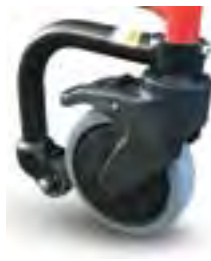
5" Front Total Locking Casters with Crash Stabilizer (Standard)