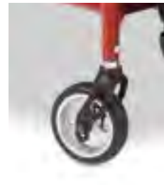
5" Front Aluminum Caster (Upgraded)