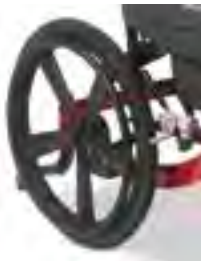
20" Rear Mag Wheels (Upgraded)