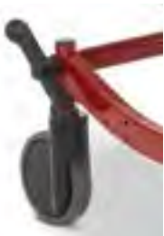
6" Rear Multi Directional Locking Caster (Standard)