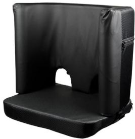
Tall Comfort Foot Double without Lower Limb Separator Shown