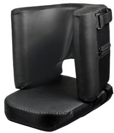
Standard Comfort Foot Single Shown

*DO NOT SEND PROTECTED HEALTH INFORMATION. IT IS NOT NEEDED TO MAKE THE PRODUCT YOU ARE REQUESTING.*