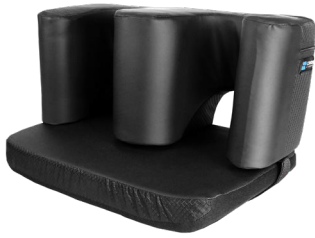
Standard Comfort Foot Double with Lower Limb Separator Shown