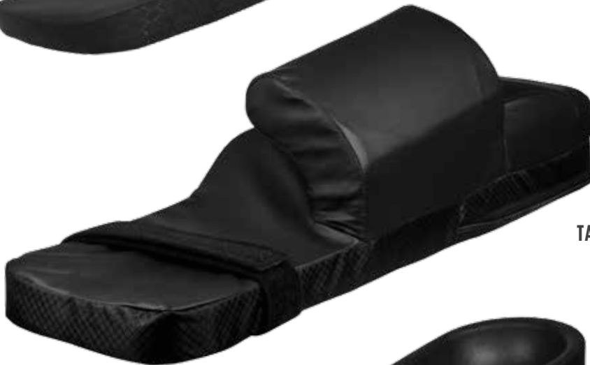
TALL RAIL ARM