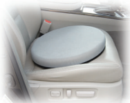
Padded Swivel Seat Cushion