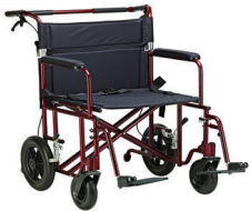
Heavy Duty Transport Chair