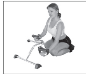
HAND ROWING EXERCISE