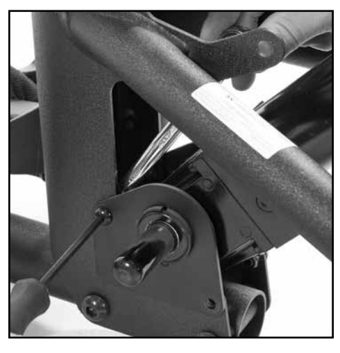
9. Use a 13mm wrench and hex wrench to remove both bolt and nut from the upper part of the pump bracket.