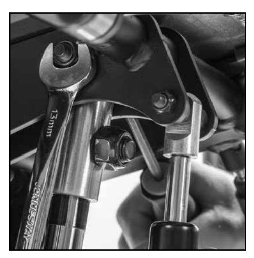
5. Use a 13mm wrench and hex wrench to remove the nut and bolt on the pump, not the damper. Set hardware aside.