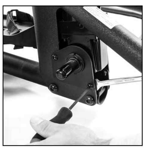
17. Use a 13mm wrench and hex wrench, insert the bolt and nut from the lower part of the pump bracket. Tighten securely.