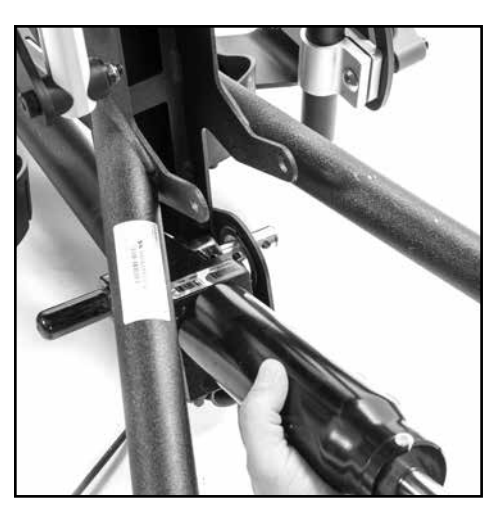
12. With the arrows on the pump facing towards the ground and the labels up, place the pump back onto the unit.