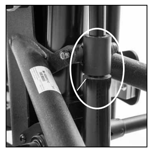
2. If you don't have the Supine opiton skip ahead to Step 5. Pumping the unit up slightly will help you access some of the components. Make sure the damper cylinder is not touching the bracket.