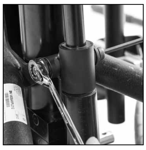
23. Place nut onto bolt and tighten securely.