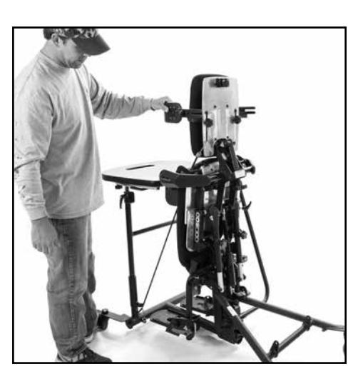
6. With assistance you can now lift the seat up to the standing position. Bungie the unit so it stays securely in the standing position.