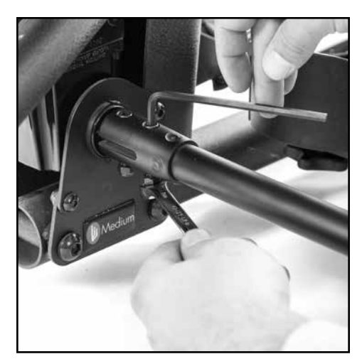
1. Remove the 2 bolts and nuts from the pump handle and set aside. Remove the pump handle and set aside.