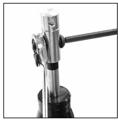
11. Use a 19mm wrench and hex wrench to remove the nut and bolt from the pump. Remove the chrome slug and place onto new pump. Tighten bolt and nut securely.