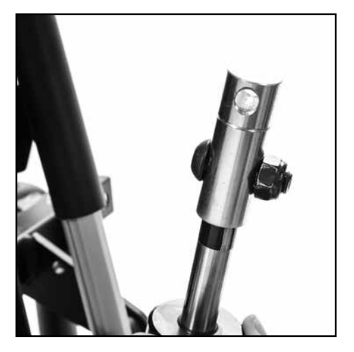
13. Make sure the bolt is postioned as shown when placing the pump back into the unit. The nut has to face towards the back of the unit.