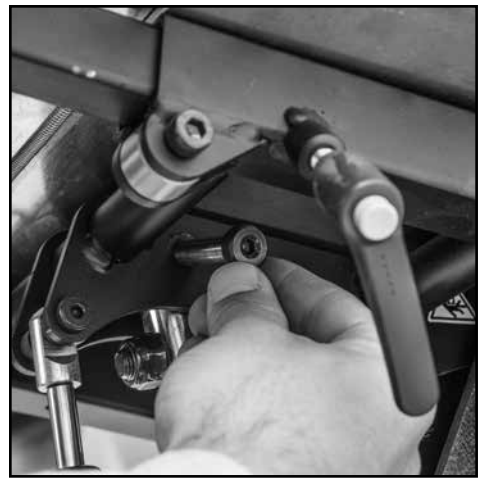
19. Line up holes on the seat and pump. Insert bolt and place nut onto bolt.