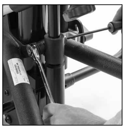
3. Use a 13mm wrench and hex wrench to remove the hardware from the damper cylinder.