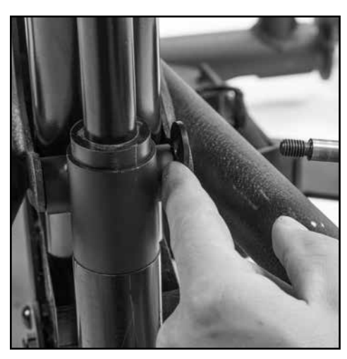
21. If you do not have the Supine option skip to step 24. Place right side washer between the brackets on the dampener cylinder and insert bolt.