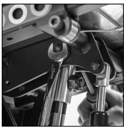
20. Use a 13mm wrench and hex wrench to tighten the nut and bolt for the pump.