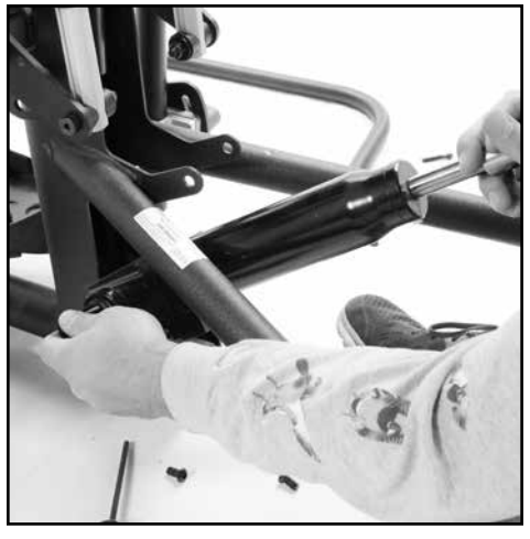
10. Carefully remove the pump from the unit.