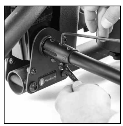
24. Place pump handle back onto the pump. Insert bolts and nuts and tighten securely.