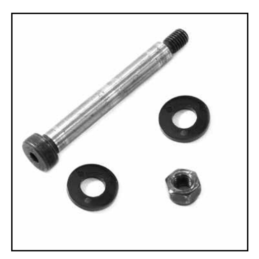
4. Set aside the bolt, 2 washers, and nut.