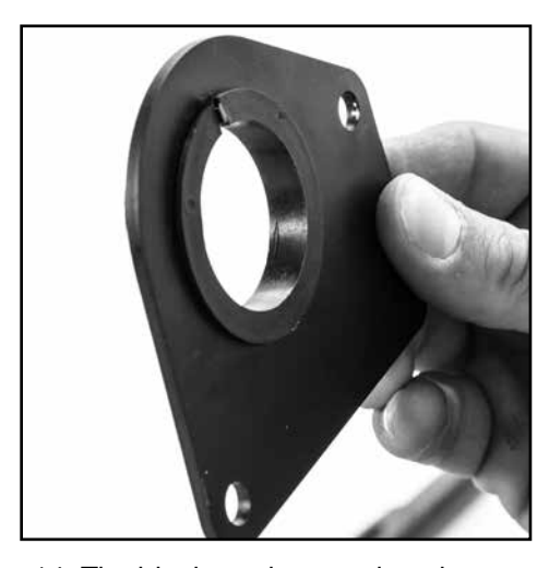
14. The black washer needs to be placed in the pump bracket as shown. With the flat part on the inside.