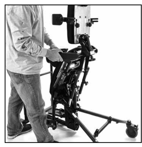
18. With assistance, lower the unit onto the shaft of the pump.