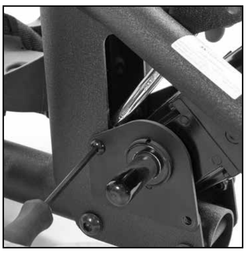
16. Use a 13mm wrench and hex wrench, insert the bolt and nut from the upper part of the pump bracket. Tighten securely.