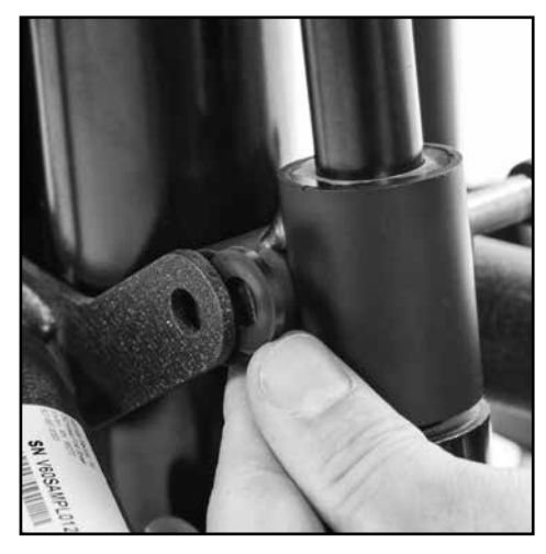
22. Place left side washer between the brackets on the dampener cylinder and insert bolt.