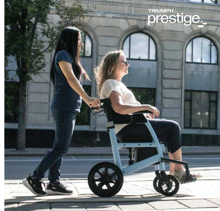
TRANSPORT CHAIR MODE