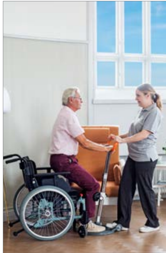
A safe transfer which allows eye contact and good communication.

The Turner PRO works well on different flooring materials including carpets.