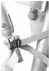
The lift arm is folded down and securely fastened to the mast with a tension strap.