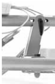
Finally, the mast is folded down towards the base.

The convenient size as well as the possibility to collapse the lift make Carina350 a significantly more flexible solution than, for instance, a stationary lift system. The lift can be used in all situations, and, when it's needed more elsewhere, it is easy to move between different users, rooms and homes. The lift is delivered collapsed.