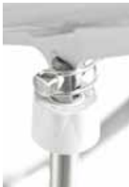
Using a quick-connecting locking pin, the actuator is released from the lift arm.

With just a few, simple operations and without any tools, Carina350 can be collapsed or set up as required.