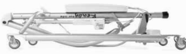
Carina350 requires very little space when collapsed. The measurements are 370 x 645 x 1250 mm (14.5" x 25.3" x 49.2").