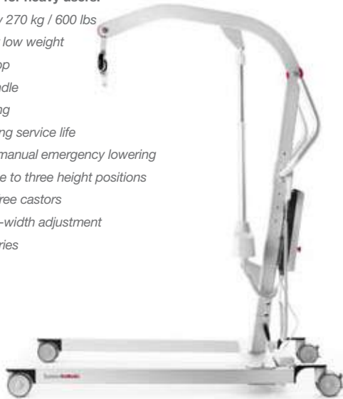
Eva600EE complies with requirements for Class 1-products in the European Medical Device Directive MDD/92/43/EEC.