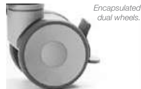
Encapsulated dual wheels.

The ergonomic handle is height-adjustable to enable the caregiver to work more conveniently, comfortably and in an ergonomically correct manner that prevents occupational injuries and minimizes discomfort for those who already have an injury. The smooth surface of the handle is easy to keep clean.