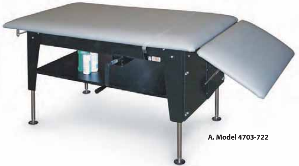
A. Model 4703-722