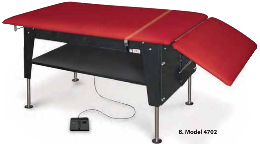
B. Model 4702