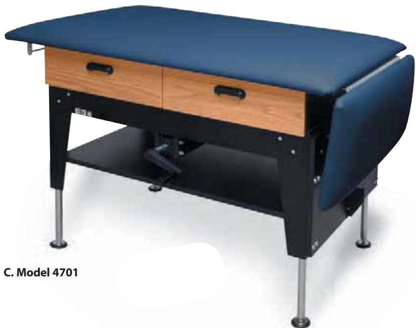
C. Model 4701