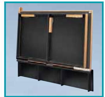
Model 1420-346-119 (folded)