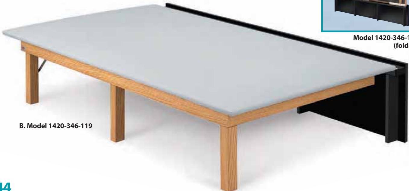
B. Model 1420-346-119