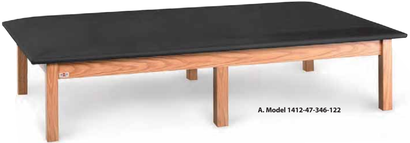
A. Model 1412-47-346-122