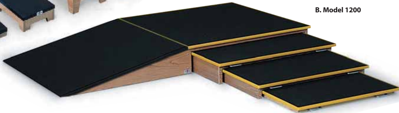
B. Model 1200