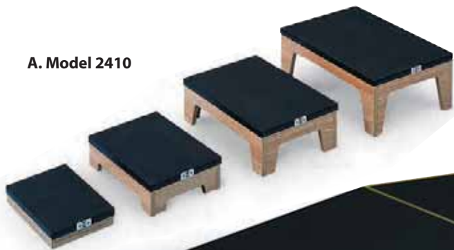
A. Model 2410