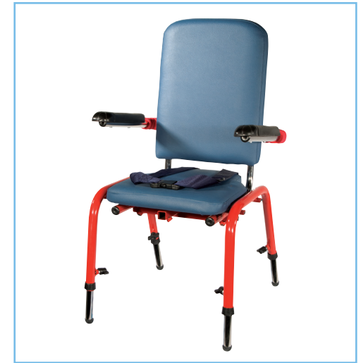
Item # FC 2000N