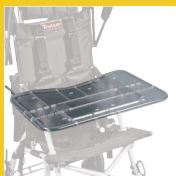
Upper Extremity Support