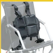
Full Torso Vest