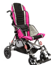
Punch Buggy Pink