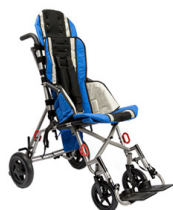
Jet Fighter Blue