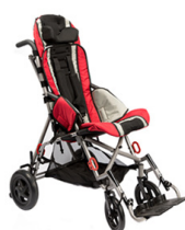
Fire Truck Red