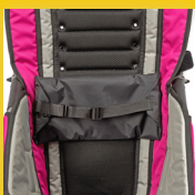
Lateral Support & Scoliosis Strap