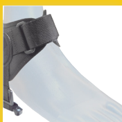
Poziform Ankle Positioners