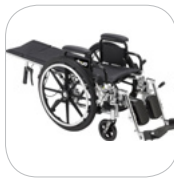
Backrest Reclines From 90° to 180°