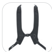
Backpack Style Chest Harness