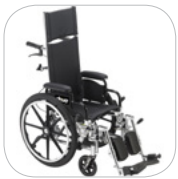
Lightweight 24" Mag-style Rear Wheels