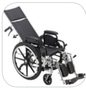
State-of-the art Hydraulic Reclining Mechanism