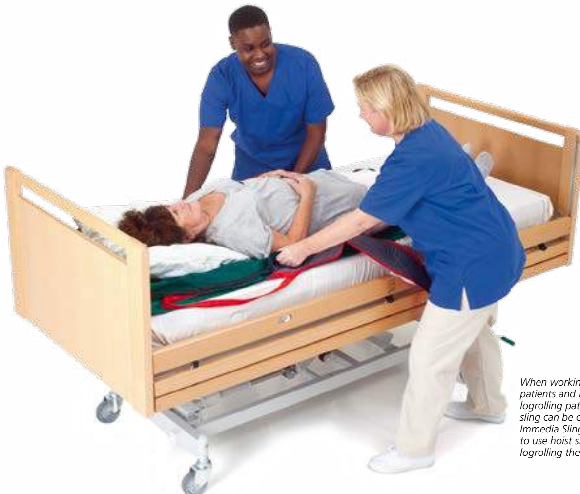
When working with bariatric patients and narrow surfaces, logrolling patients with a hoist sling can be challenging. The Immedia SlingOn allows you to use hoist slings without logrolling the patient.