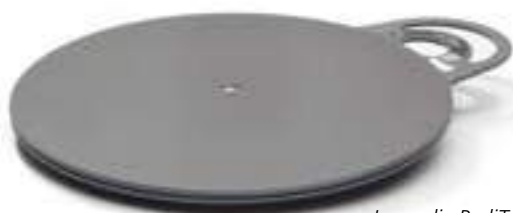
Immedia PediTurn HARD