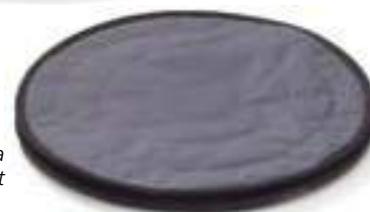
Immedia HandySwing Seat