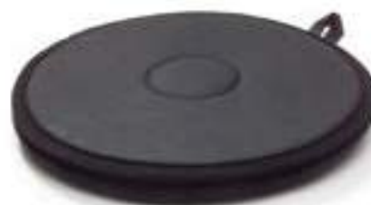
Immedia PediTurn SOFT