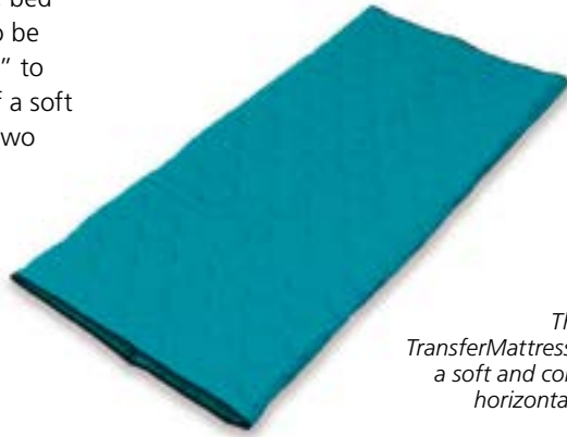
The quilted TransferMattress provides a soft and comfortable horizontal transfer.

Immedia TransferMattress can be combined with a waterproof nylon cover or a disposable cover. Immedia TransferMattress should not be used if there is a gap between the two transfer surfaces.