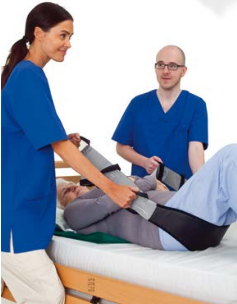
Immedia Sling with handles acts as an extension of the arms, allowing the caregivers to offer support and assistance whilst maintaining a good ergonomic position and grip.