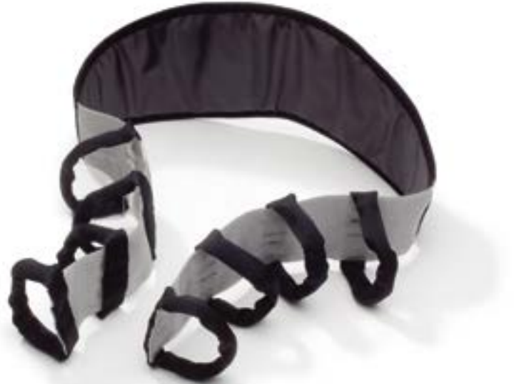
Immedia Sling is a flexible aid offering a number of different functions.

Immedia Sling has 4 handles on each side and a non-slip material on the inside to secure the user during the transfer. The outside has a low friction surface to aid transfer and removal.