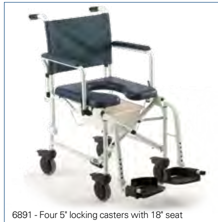
6891 - Four 5" locking casters with 18" seat