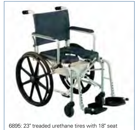
6895: 23" treaded urethane tires with 18" seat