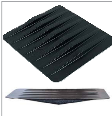
Cushion Rigidizer – lightweight and low profile