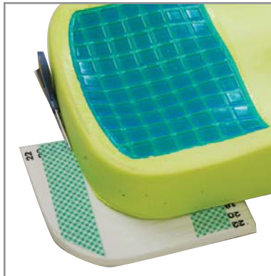
POK – Pelvic Obliquity Kit (2 pieces) accommodates up to one inch of obliquity