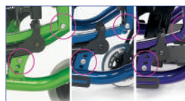
Tilt assist feature

ADJUSTABILITY. RELIABILITY. SERVICEABILITY.