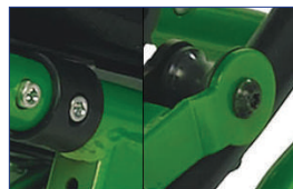
Color coded hardware