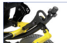
Transport brackets (TRBKTS)