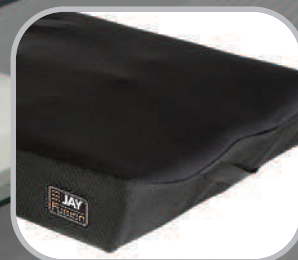
Reduced Profile Option