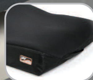
Reduced Profile Option