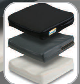
Pediatric Option: JAY Zip