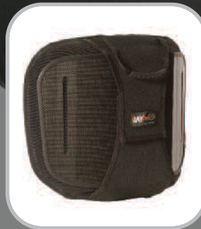
Carbon Fiber Option