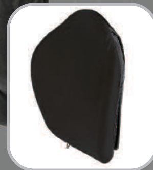
Pediatric Option: JAY Zip