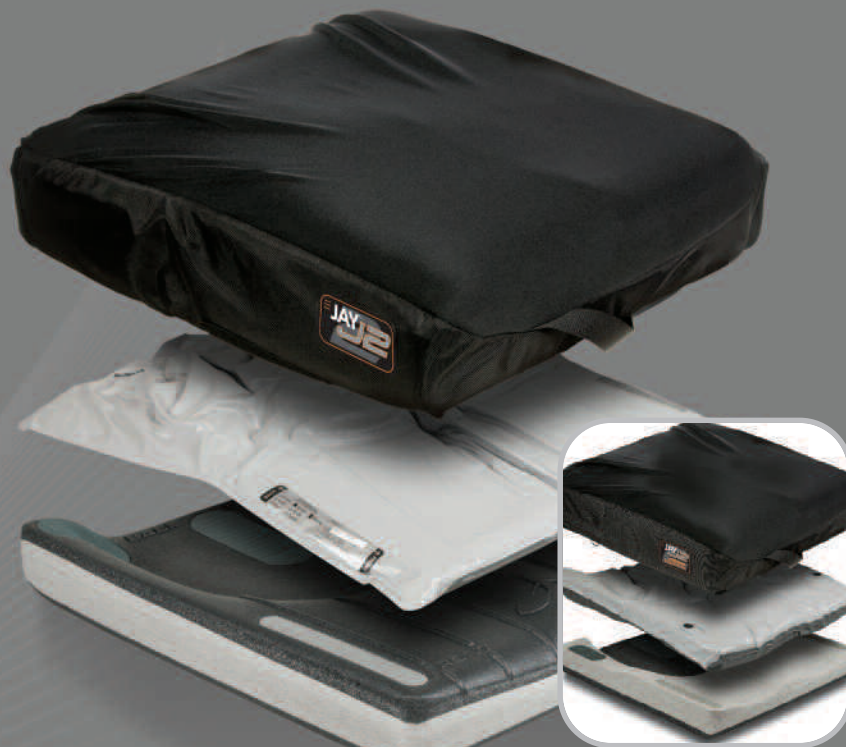
JAY J2 Deep Contour