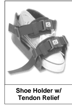
Shoe Holder w/ Tendon Relief