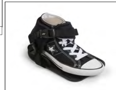
Ankle Positioning System