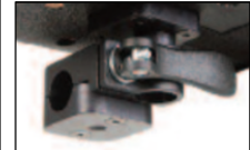
Swing Away Hardware