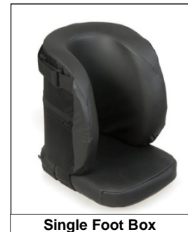
Single Foot Box