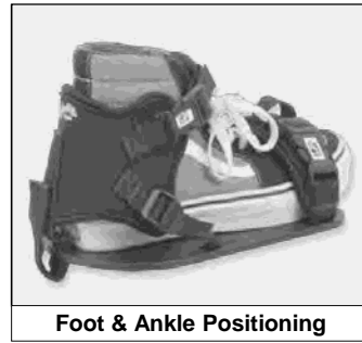
Foot & Ankle Positioning