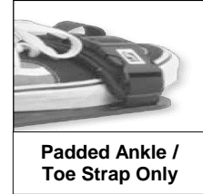
Padded Ankle / Toe Strap Only