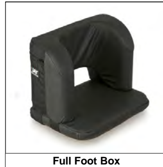
Full Foot Box