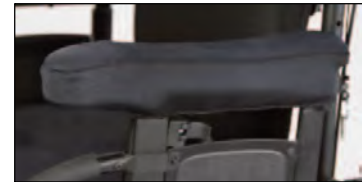
Armrest Gel Pad Cover