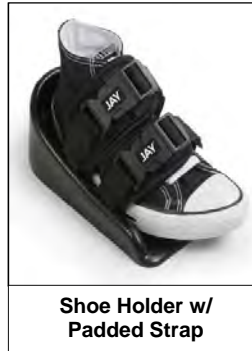
Shoe Holder w/ Padded Strap