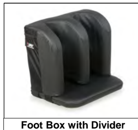
Foot Box with Divider