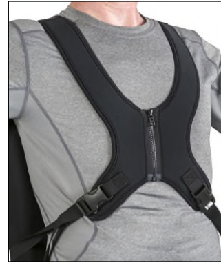
Center Opening with Zipper