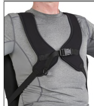
Center Opening with Buckle