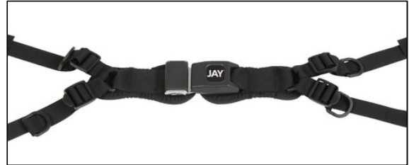
4-Point Padded Push Button Belt