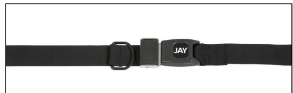
2-Point Push Button Belt