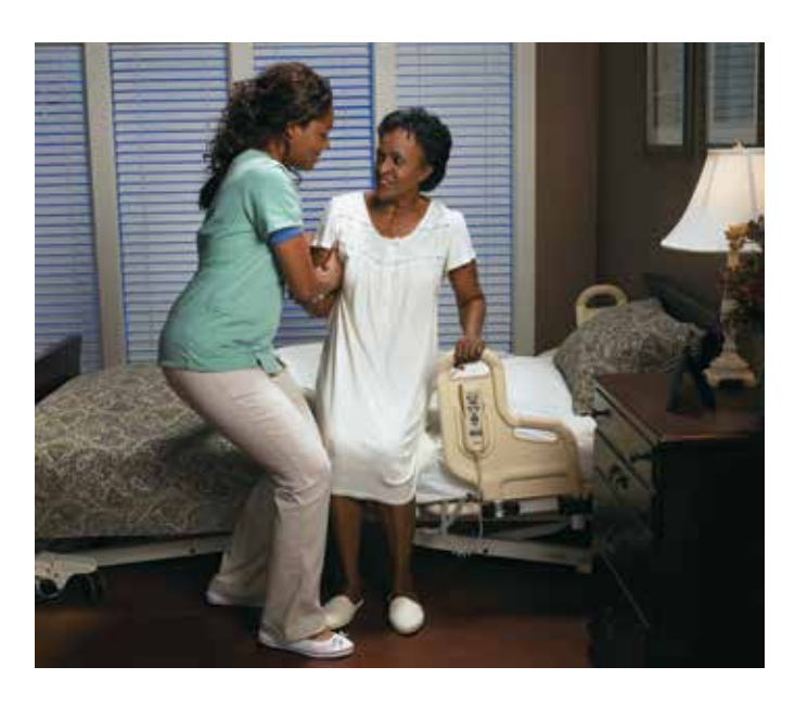
It's a superior bed for SKILLED NURSING FACILITIES

The UltraCare XT has been created to look as great as it functions with features that offer residents the comforts of home. The UltraCare XT's UltraWide extension kit expands beyond a twin width and provides safer repositioning. For even more resident comfort, the PrevaMatt Elite surface is soft, yet highly resilient, gently cradling the resident's head and torso. Strategically-located mattress cuts promote easier flexing when the bed frame is contoured and keeps the resident in place to reduce the need for repositioning.