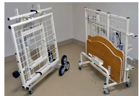
Transport Dolly and Stair Climber