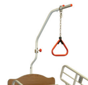
Trapeze Patient Helper