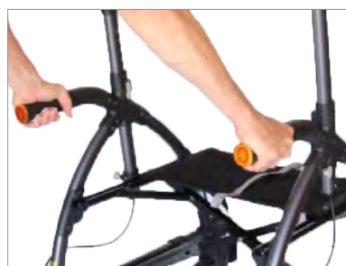
Fig I 1