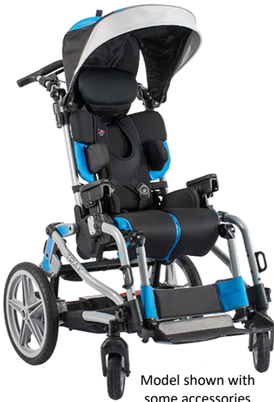
Model shown with some accessories