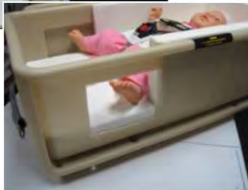
3 pt Harness Child over 10 pounds un-casted