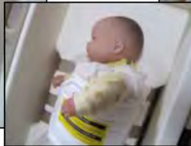
Small and Large Side Facing Restraint Bags