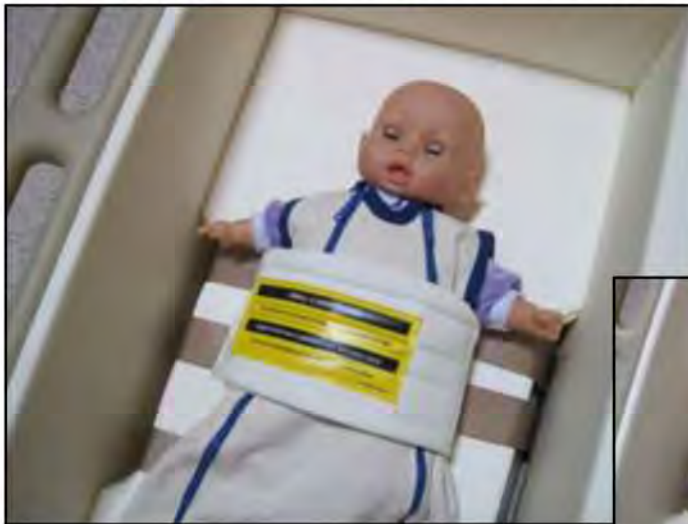
Small Restraint Bag 4.5 to 10 pounds