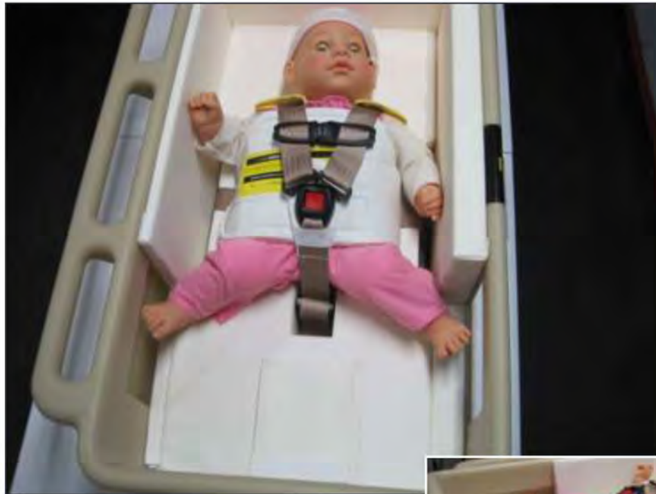
Modified Small Restraint Bag Child 4.5 - 10 pounds un-casted