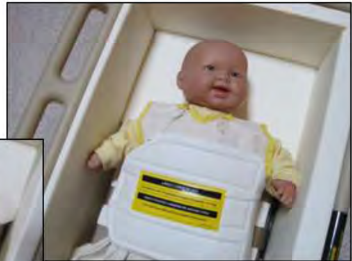
Large Restraint Bag 10 to 35 pounds