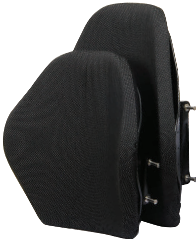
E2 - 3" Contour