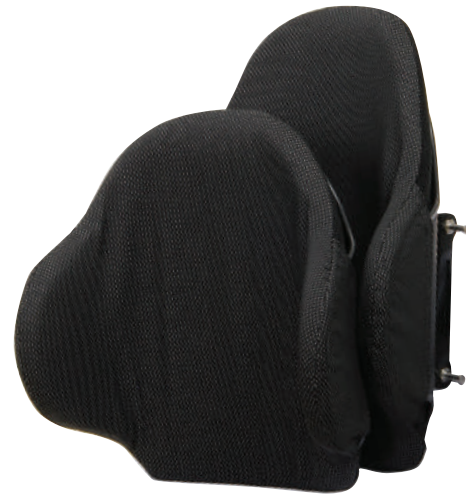
E2 Deep - 6" Contour