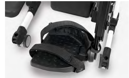
962 Footrests + Heelrests