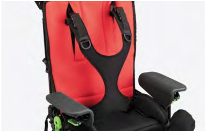
853 slim Four point shaped harness