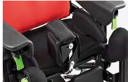
834R Adjustable abduction block in depth and abduction. Available in two sizes.