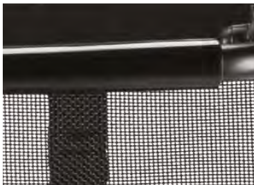
Load bearing upholstery

> Removable cover is made by very breathable and high quality material both internally and externally. The inner padding has a highly innovative leading edge structure , that is three-dimensional, lightweight , providing extremely high air circulation, optimal weight distribution and excellent comfort. The external fabric is highly resistant to abrasion too. Fire retardant according to EN 1021-1:2014 and EN 1021-2:2014 standards.