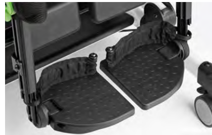
960 Heel rests

It is made of resistant and hygiene material, no edge design, it does not retain any residue of food.