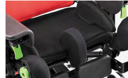
834N Narrow abduction block Adjustable in depth along with the seat. Available in two sizes.