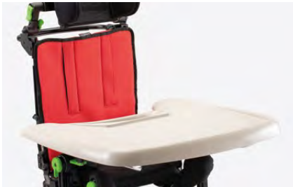
824 Tray with wrap-around recess Adjustable in depth, height and tilt with armrests.

It is made of resistant and hygiene material, no edge design, it does not retain any residue of food.