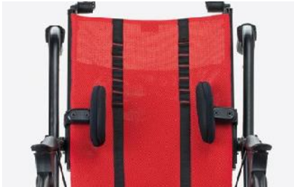
838 Trunk side supports adjustable in height, width and rotation. Available in two sizes.