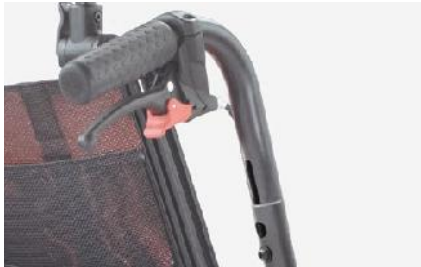
951 Height adjustable push handles

It increases the total height of max. 7 cm/2,7 in (94-101 cm/37-39,7 in)