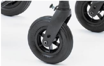
812 Front wheel directional locks