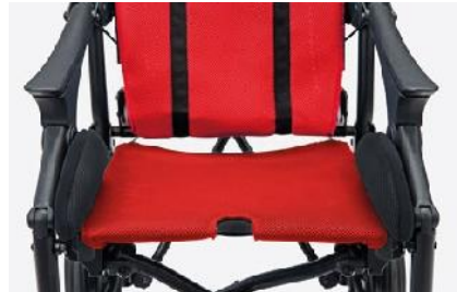
958 Padded pelvic side supports