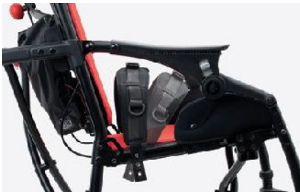
947 Pelvic belt with variable angle Available in two sizes.