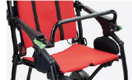
839 Front handlebar Adjustable in tilt. Easy to remove to fold the stroller.