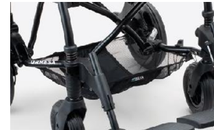
858 Shopping basket