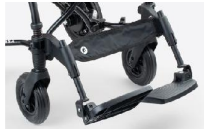
956 Footrests adjustable in tilt