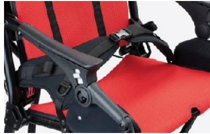
920 Four point pelvic belt Available in two sizes.