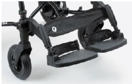
960 Heel rests