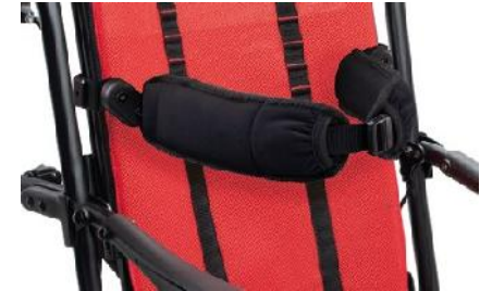
868 Wrappable and flexible trunk supports Adjustable in height, width and transversally.