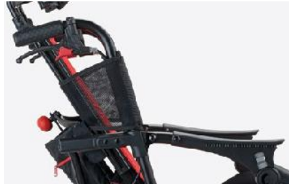
844 Padded side protection covers