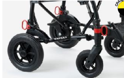
891 Set of 4 tie down hooks for the forward-facing transport of the pushchair in a motor vehicle (private/cars, buses..). See User and Maintenance Manual provided with the aid.

It increases the total height of max. 7 cm/2,7 in (94-101 cm/37-39,7 in)