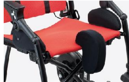
834N Padded abduction block removable. Available in two sizes.