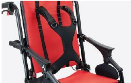
853 slim Four point shaped harness