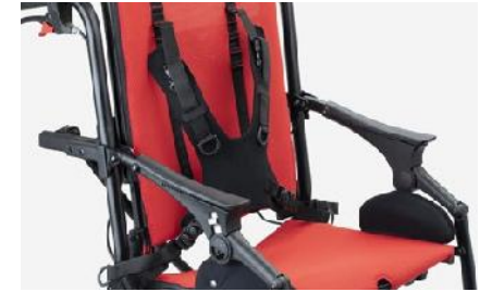
853 Vest harness