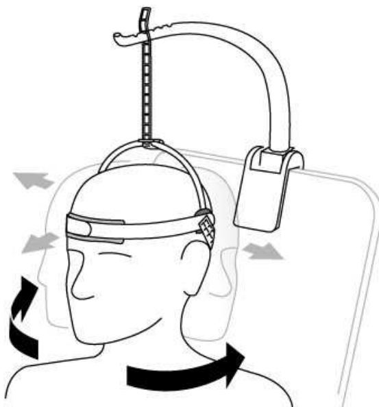
Fig. 1 Movements permitted with the use of Headpod